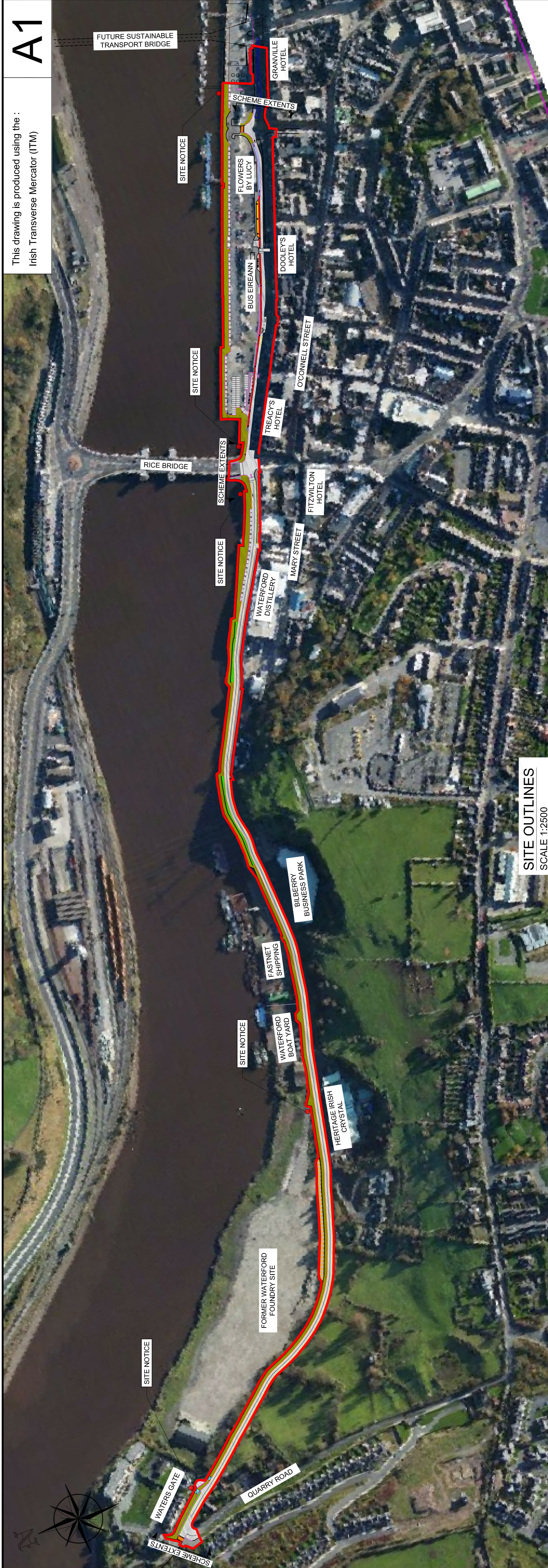
SITE OUTLINES SCALE 1:2500

This drawing is produced using the : Irish Transverse Mercator (ITM)